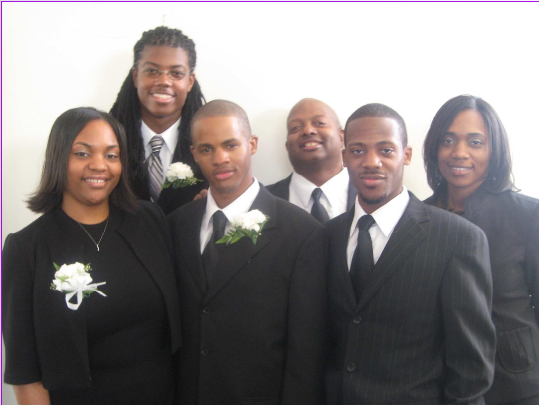
MARVELOUS LIGHT CHURCH DEACON BOARD